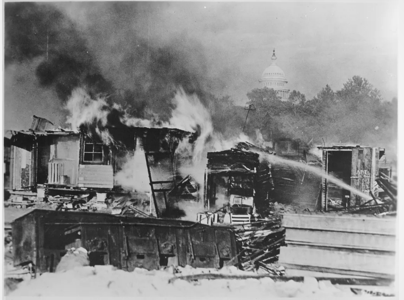
The Bonus Army, 1932